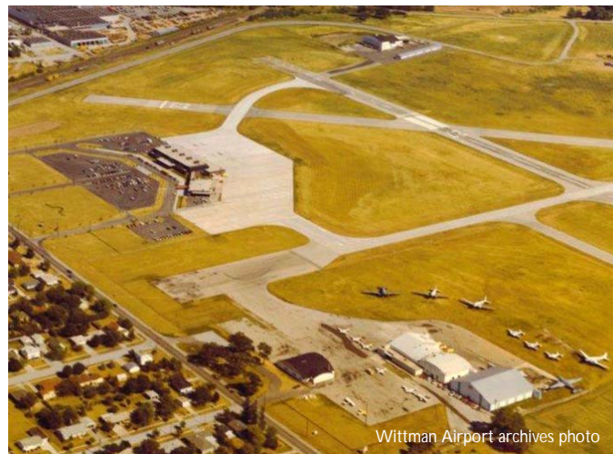
Wittman Airport archives photo

Reprinted with permission from the Wittman Regional Airport blog. More at: www.WittmanAirport.com .