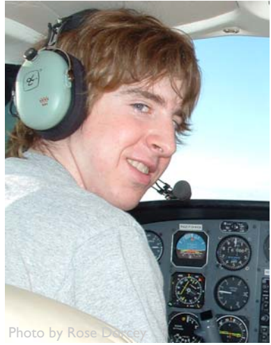
A David Clark headset is just one of many fine brands to choose from.