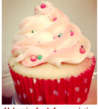
Help raise funds for an aviation scholarship by purchasing cupcakes for just $1 each at the EAA Chapter 252 breakfast on April 13 in Oshkosh. Yum!