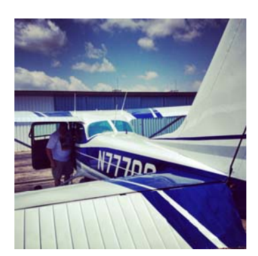
N7770G wouldn't stay so shiny clean without your help. Hope to see you at the next meeting!

Please plan to attend—it's a great way to enjoy the company of your fellow members! And who doesn't like waxing an airplane?