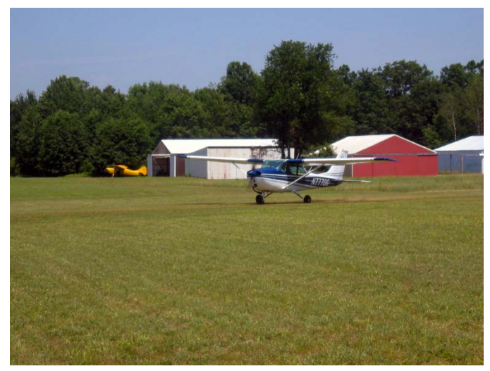
WFC's N7770G shortly after landing on the grass strip at Central County Airport (68C) earlier this year.